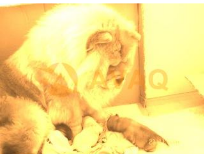
Recommended For You